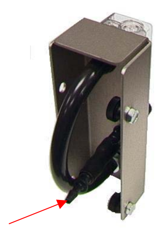
Nitrogen Supply Connection