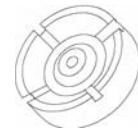
Figure 2: Front Seal with slots