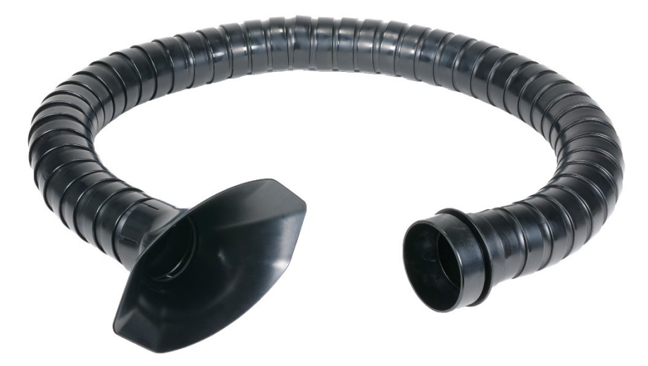
SteadyFlex<sup>™</sup> ESD-Safe Flex Arm & Nozzle Assembly